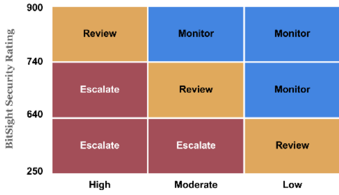
Vendor Risk Tiering & Segmentation

Every company rating includes a Remediation Strategy section, highlighting the risk vectors with the highest rating impact over the last 60 days. Organizations can reference these to identify areas for immediate improvement. Also, since BitSight provides a great level of detail upfront on the companies you monitor, you can prioritize actions for those that pose the most imminent risk. Many organizations focus on companies that have a BitSight Security Rating of 640 or below as they fall into the "Basic" category. Companies can also leverage alerts so that they are notified when the rating of companies drops to a customizable threshold. The matrix below reflects how some organizations prioritize actions based on ratings: